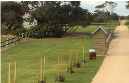
40-foot wide 'Calling Ground' between post-and-rail fences. To the right, a path marks the line of the original entrance boundary of the Quarantine Station. Note the Police Guard box and adjacent Gatekeeper's Cottage in the background.