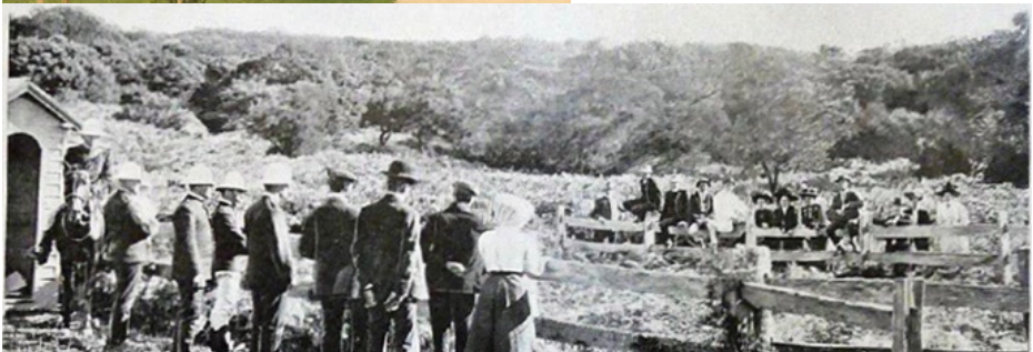
Quarantined passengers off the 'Otway' visited by friends, separated by the 40-foot wide 'Calling ground.'