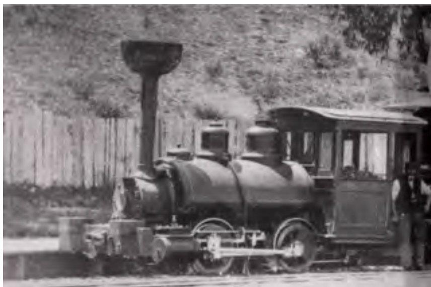
Sorrento Steam Tram

Nepean Historical Society acknowledges and pays respect to the Boon Wurrung/ Bunurong people, the traditional custodians of these lands and waters.