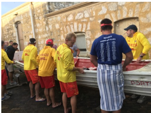
Installing the lifesaving boat in the museum courtyard