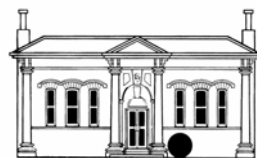
Nepean Historical Society Sorrento