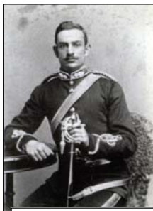
John Monash c 1888

The uniform is similar to that worn by John Monash who was a member of the Metropolitan Brigade of the Garrison Artillery who often trained at Queenscliff, pictured here in 1888. The artillery was later reconstructed and from July 1903, Captain Monash's battery became No.3 Victorian Company, Australian Garrison Artillery.